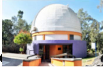
National Institute of Astrophysics, Optics & Electronics